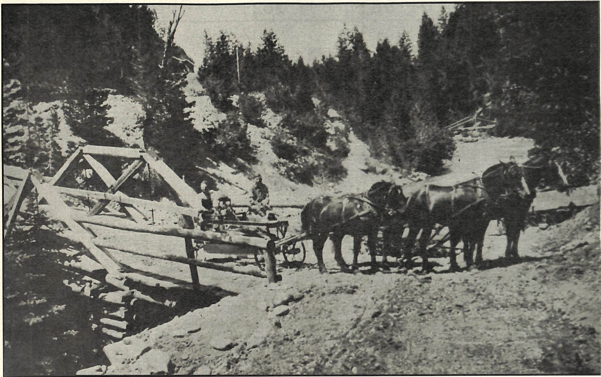
Greys River Road