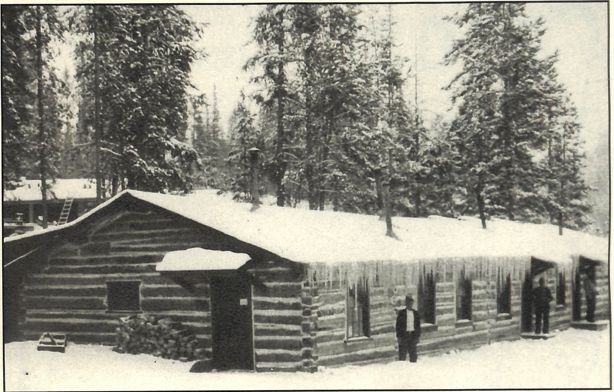
ERA Camp at Smith Fork