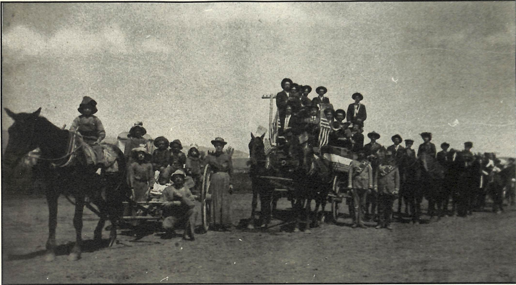
4th of July Parade - Grover, Wyoming 1920