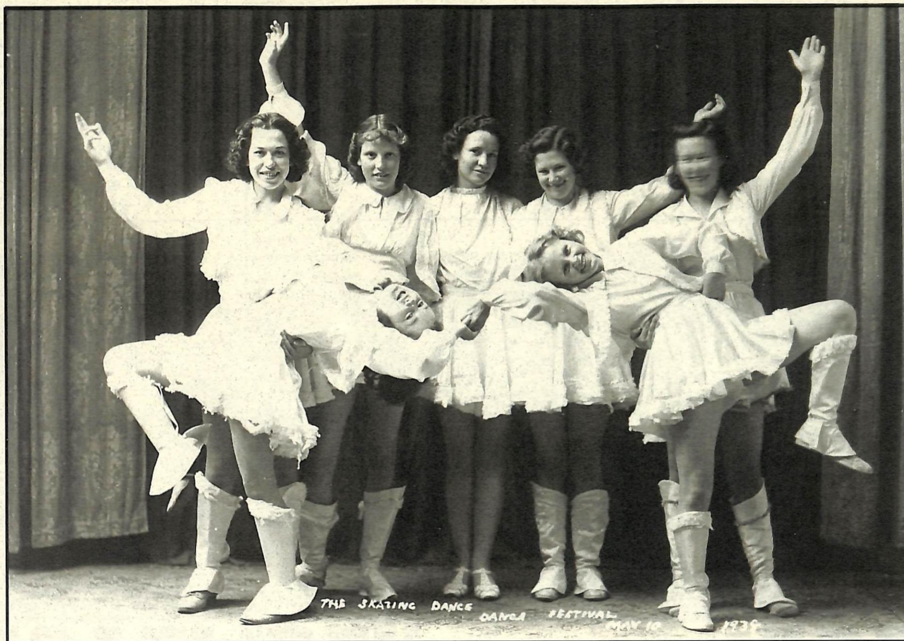
1938 Dance Festival