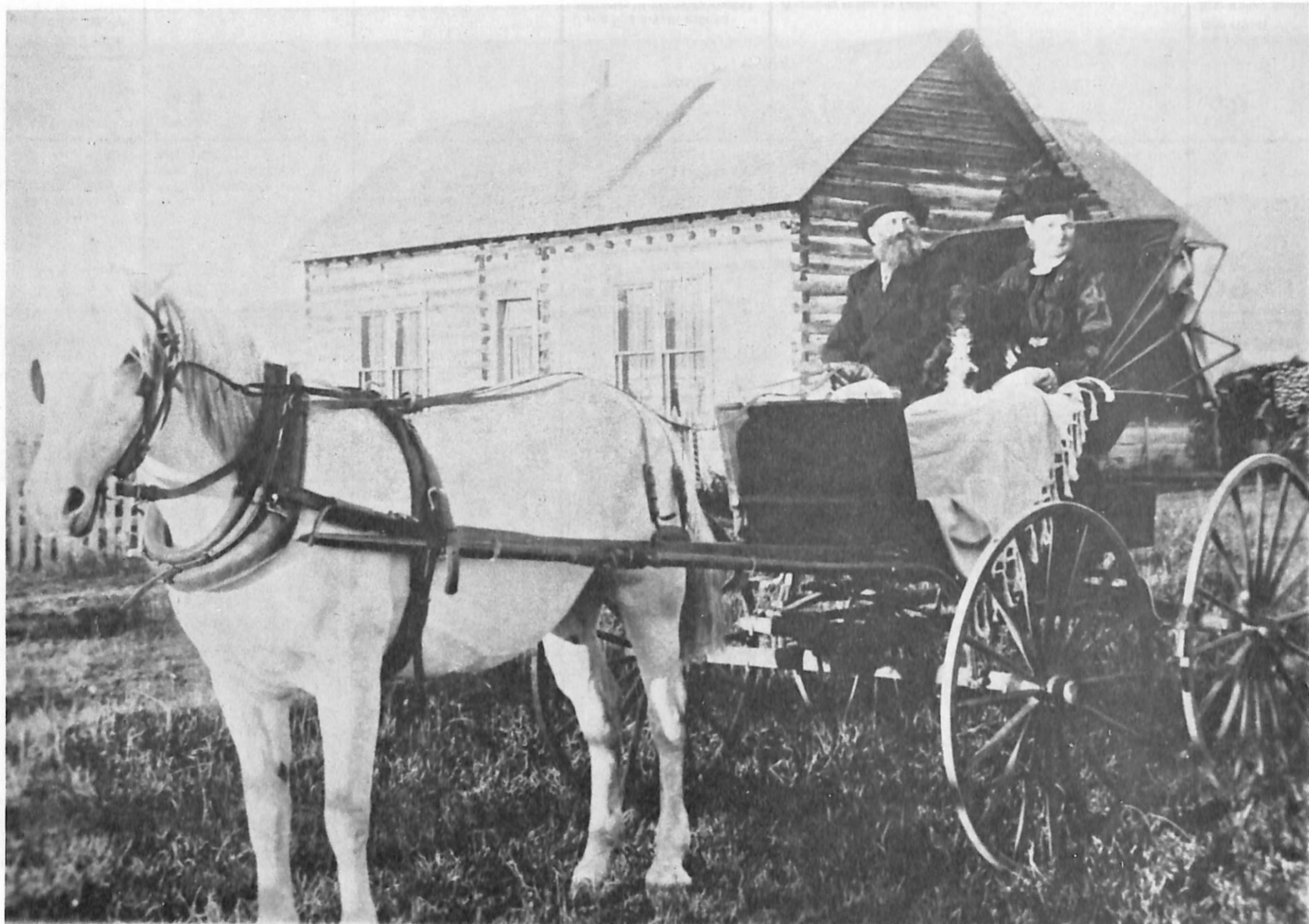
Carl Erickson and wife Beata seated in buggy in front of log house in Freedom.