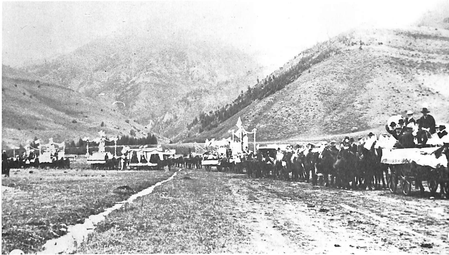
Parade on the Town Square