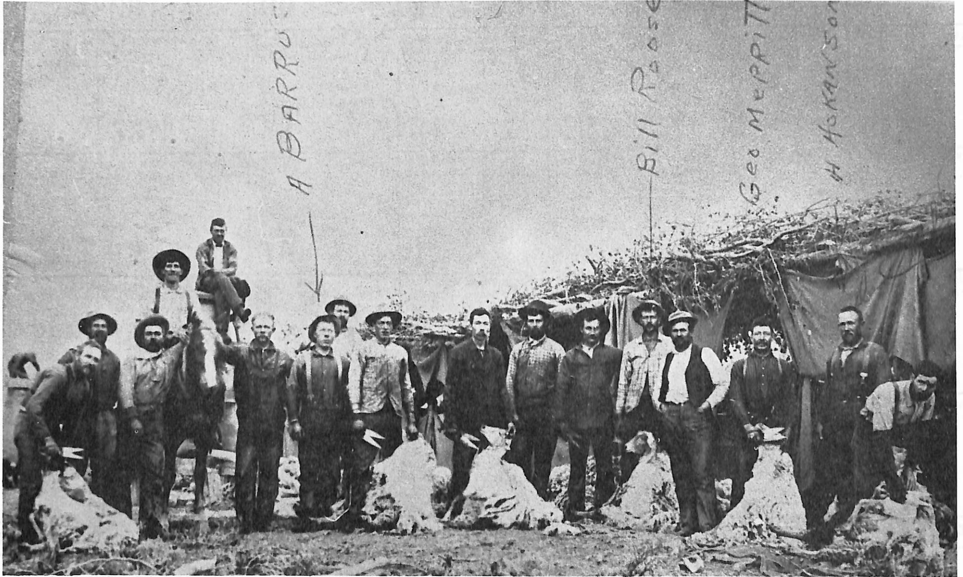
Covey's sheep shearing crew on Strawberry Creek in the narrows about 1900. They sheared their sheep in Star Valley for years.